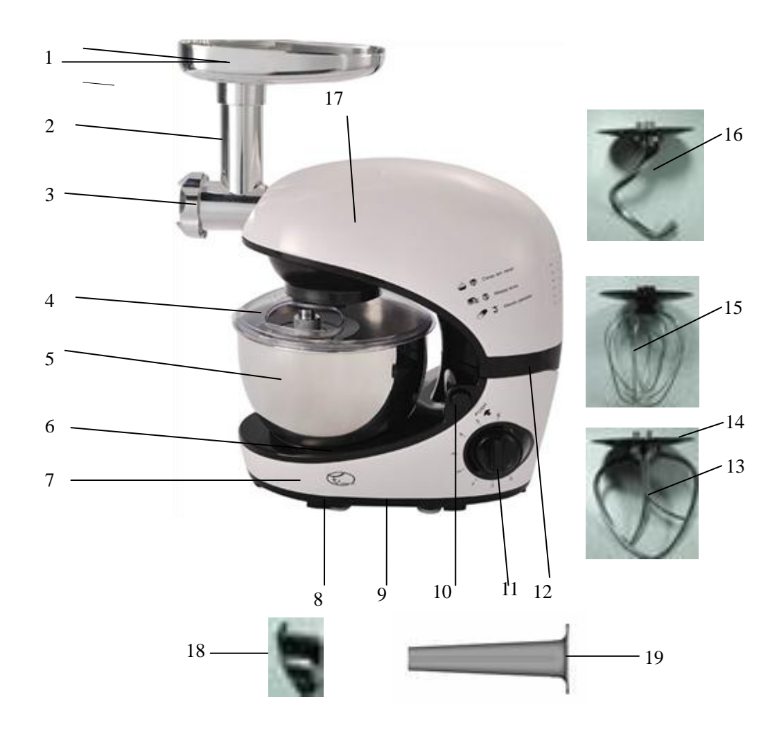
Fig. 1 Overview of components and controls