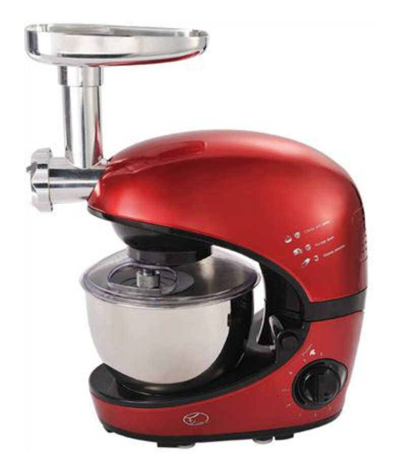
Herdsking Europe GmbH